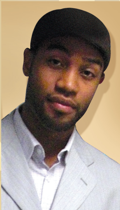
NII AMAA JAI OLLENNU REIGNSTORM YOUTH