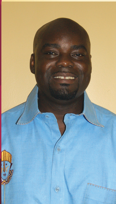
FOSTER NKETIA-GYASI PARKING